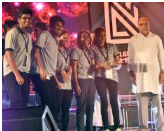
Third in Harmony: The School of the Good Shepherd