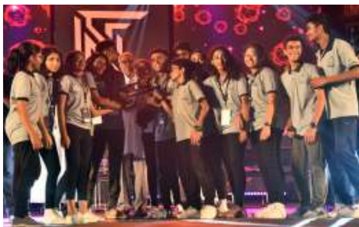
Third in Dance O' Mania: The School of the Good Shepherd