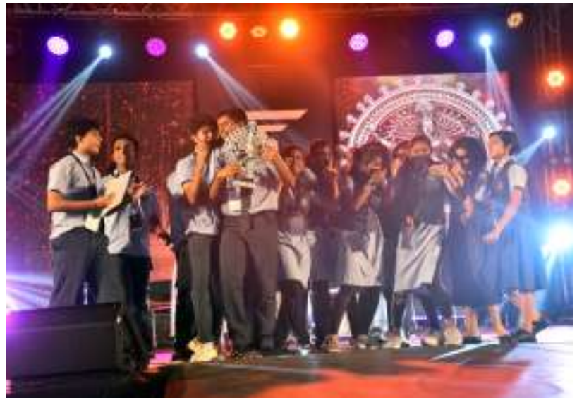
First in Dance O' Mania: Sarvodaya Vidyalaya ISC