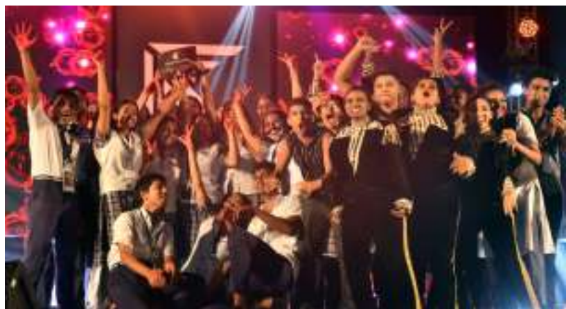
Second in Dance O' Mania: Sarvodaya Central & Saraswathi Vidyalaya