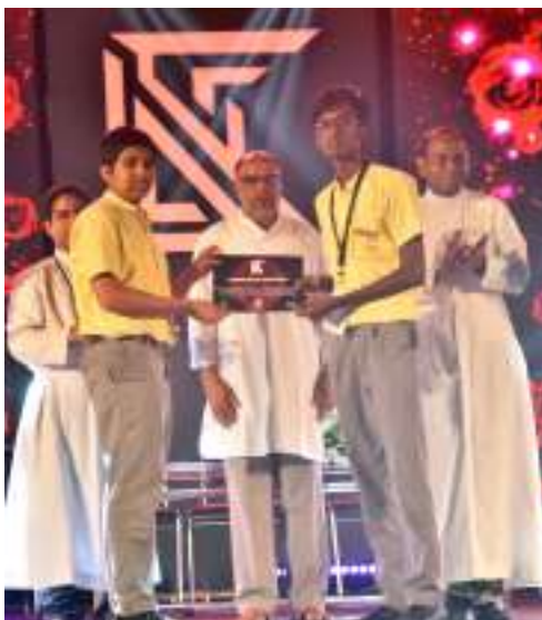
Third in Enquesta: L'école Chempaka International