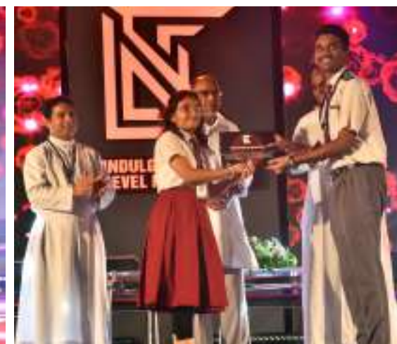
Second in L'ebate: St Thomas Central