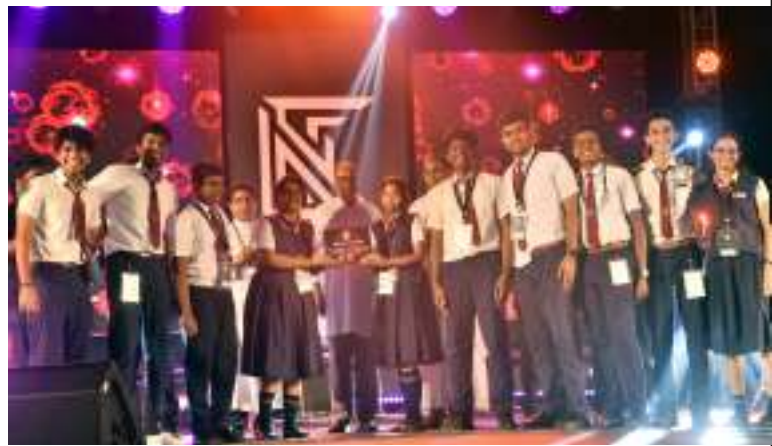
Second in Harmony: Christ Nagar ISC