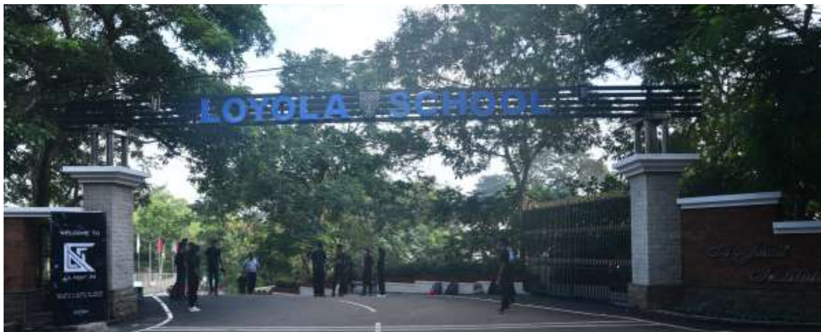
VIGIL AT DAYBREAK: Enthusiastic ushers in attendance at the main gate to receive the participants...