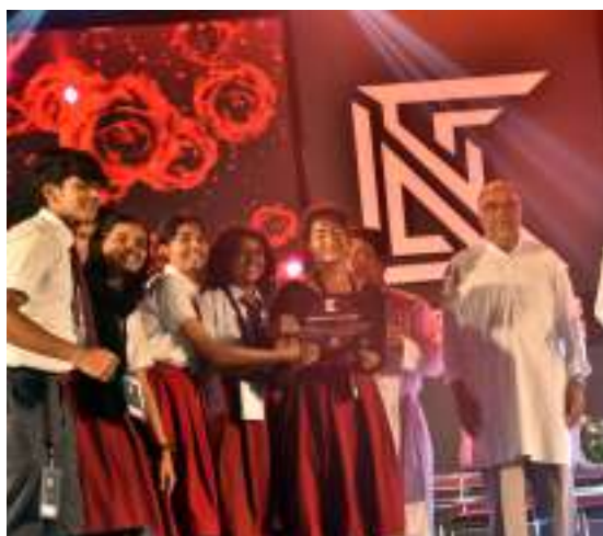
Second in L'Attire: St Thomas Central