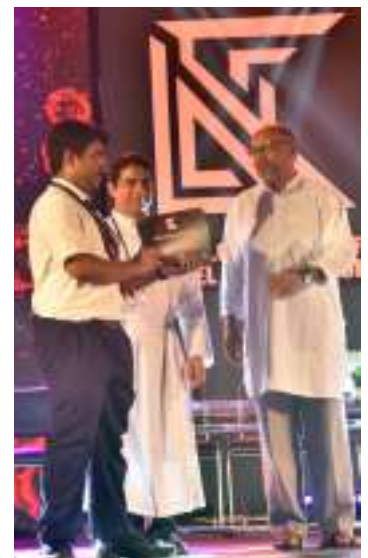
Second in Enquesta: Christ Nagar ISC