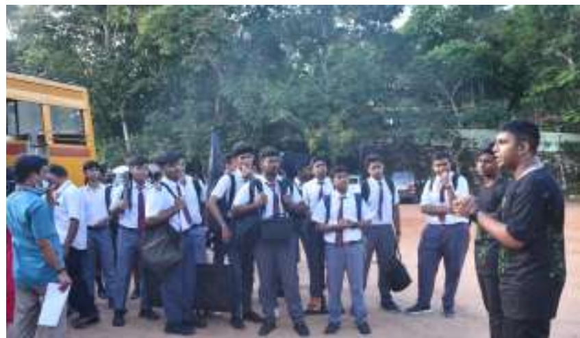
... and then begins the arrival of the participants from eleven schools...