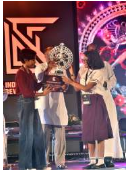
First in L'ebate: Navajeevan Bethany Vidyalaya