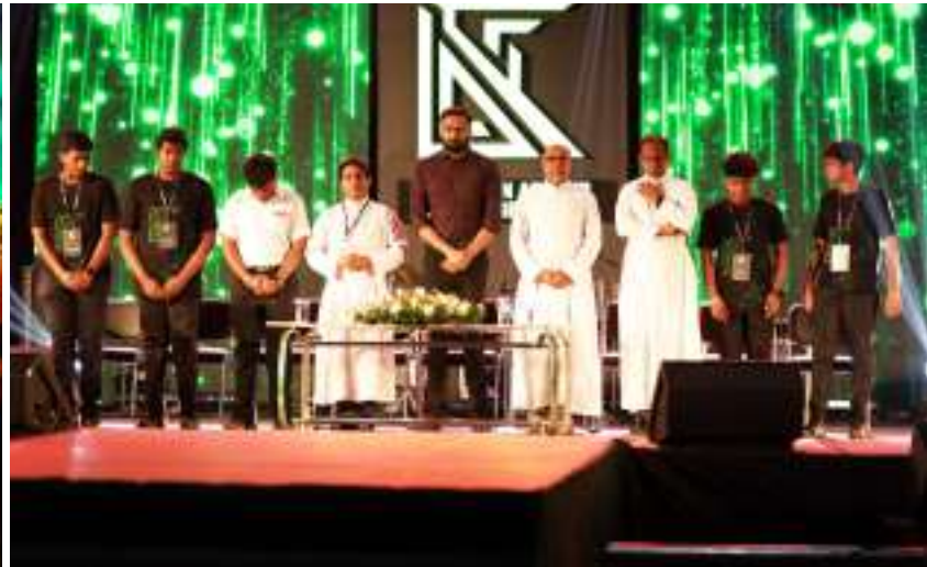
Prayerful beginning to LA Fest