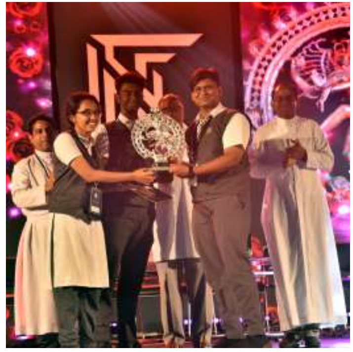
First in Pitch 101: Saraswathi Vidyalaya