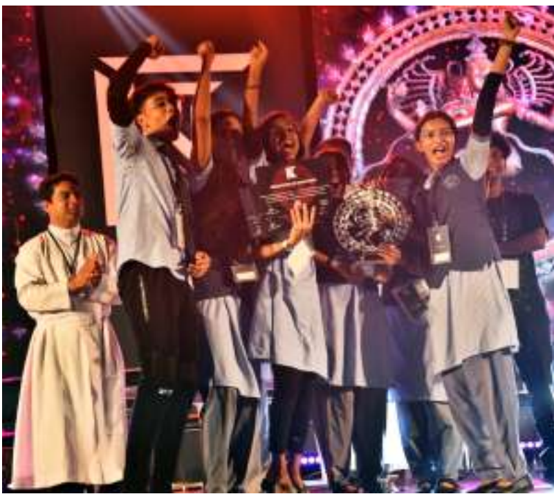
First in L'Attire: Sarvodaya Vidyalaya ISC