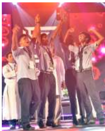
Second in Pitch 101: Sarvodaya ISC