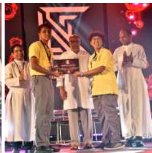
Third in L'ebate: L'école Chempaka ISC