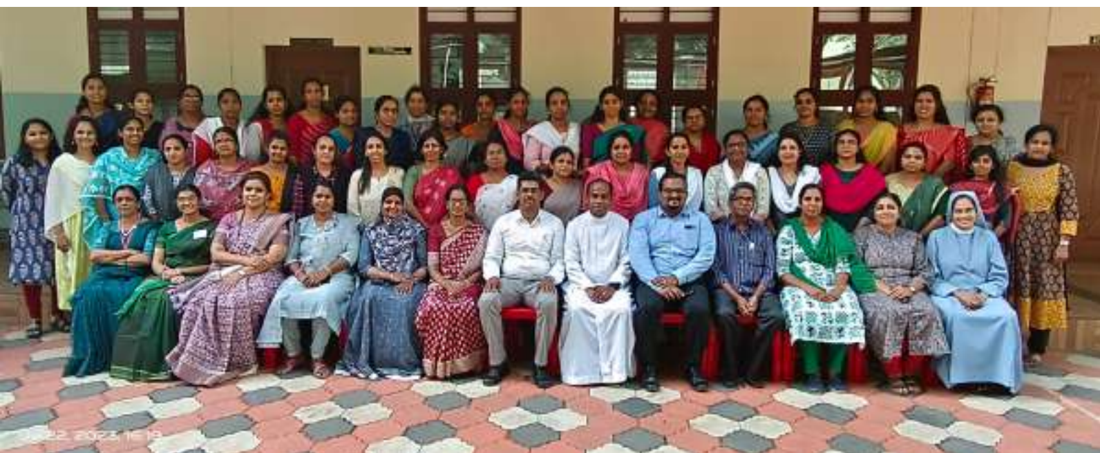
Participants who stayed back for the final huddle