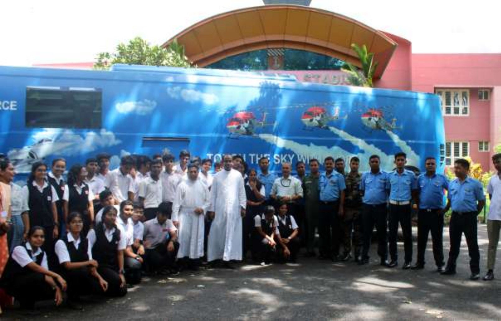
The Induction Publicity Exhibition Vehicle on Loyola School campus on 22 July 2023