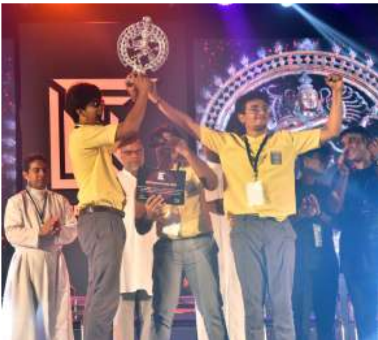
First in Block N' Tangles: L'école Chempaka ISC