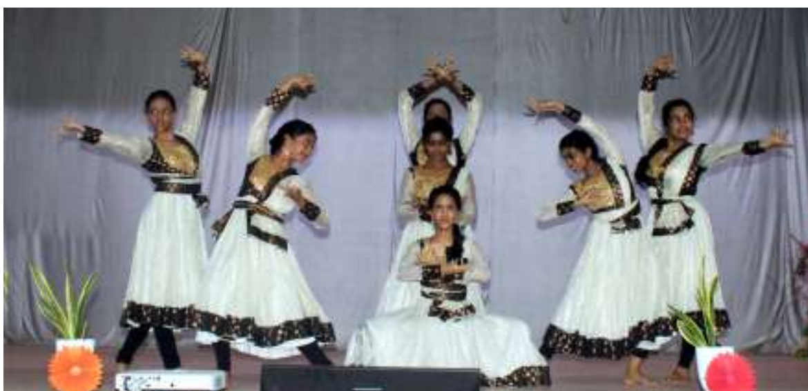
Group dance by the eleventh graders