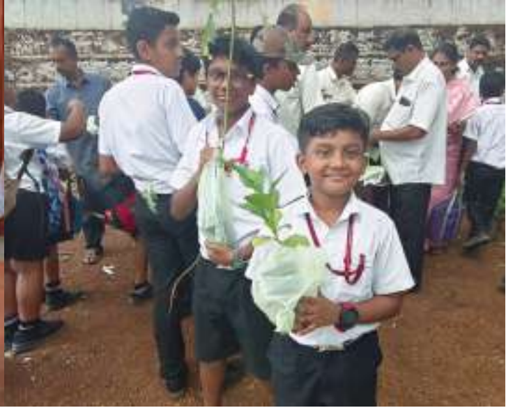
Shri Kadakampally Surendran inaugurating the distribution of saplings...