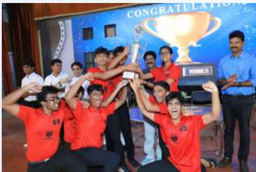
The over-all champions: SS House