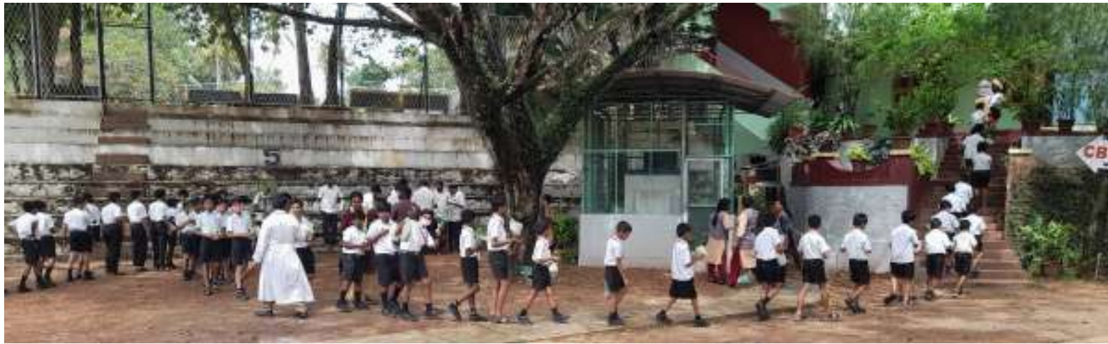
... and the classwise distribution continues