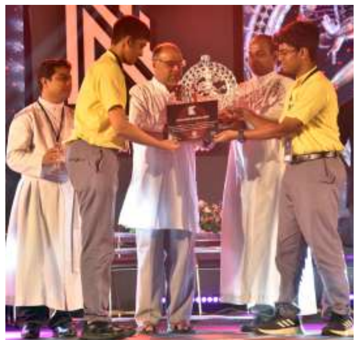
First in Enquesta: L'école Chempaka ISC