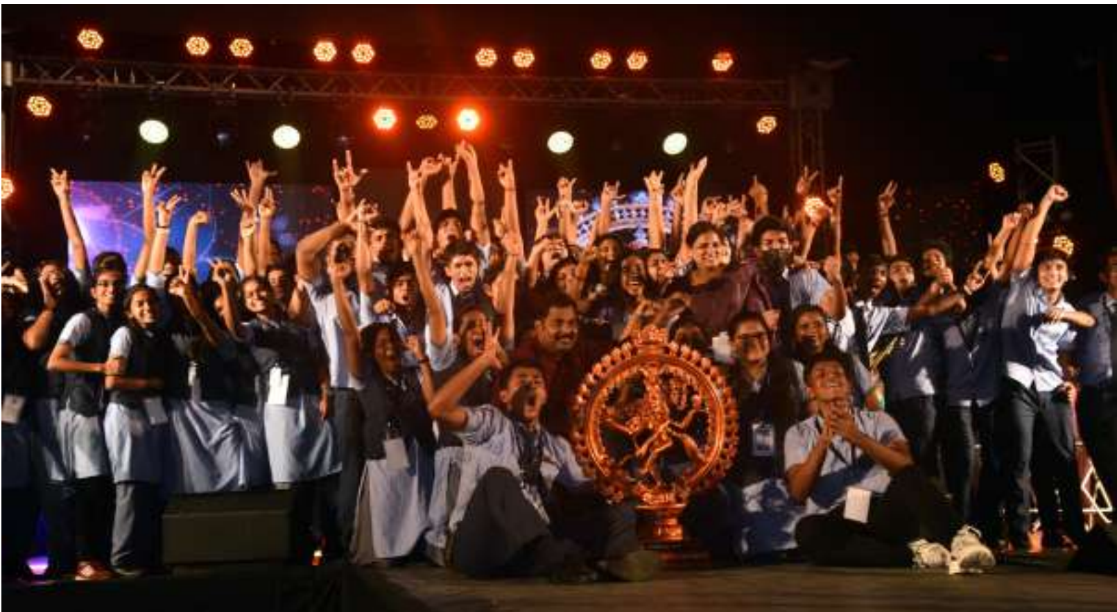
Winners: Sarvodaya Vidyalaya ISC