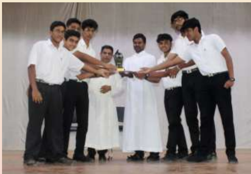
Loyola X Rhapsody team that won the First Prize in Encore , the music event in Cre8 , at L'ecole Chempaka