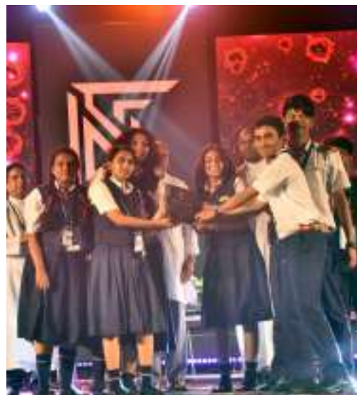
Third in L'Attire: Christ Nagar ISC