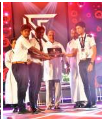
Third in Pitch 101: Christ Nagar ISC