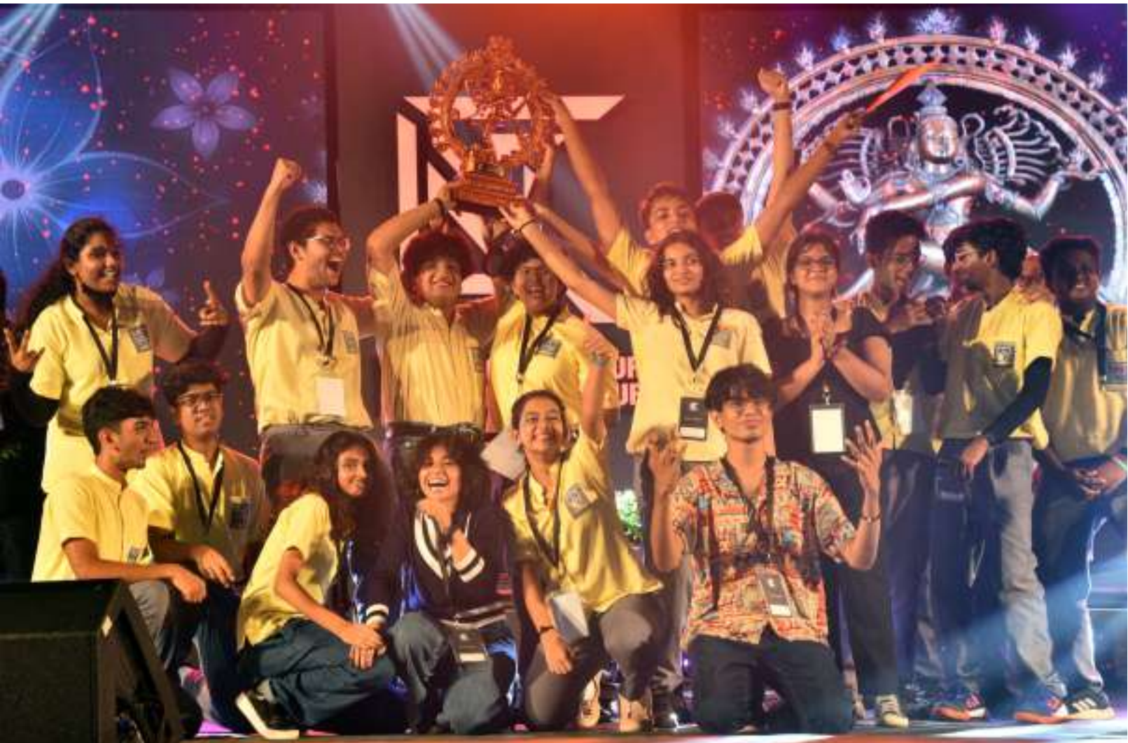
Runners-up: L'école Chempaka ISC