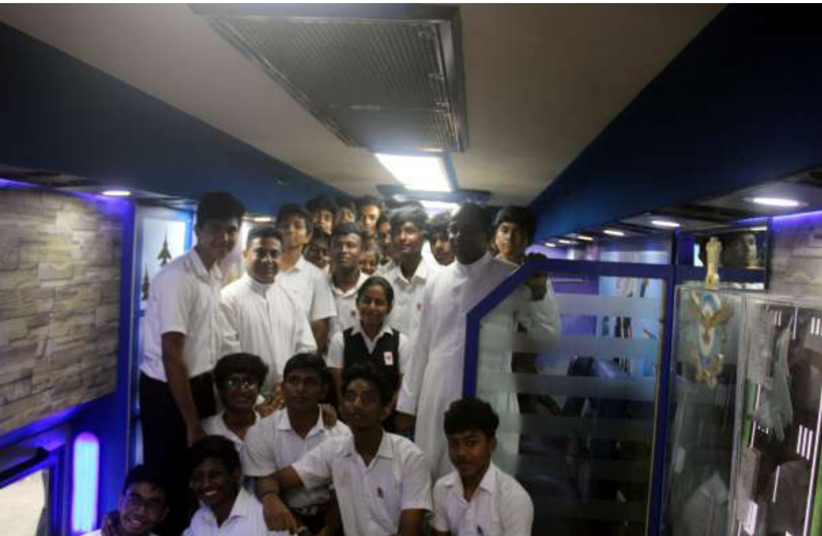
The Principals and one unit of students inside the IPEV