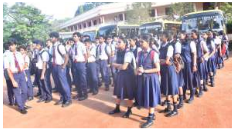
... and their cavalcade to Loyola Indoor Stadium for the formal inauguration of LA Fest 2023.