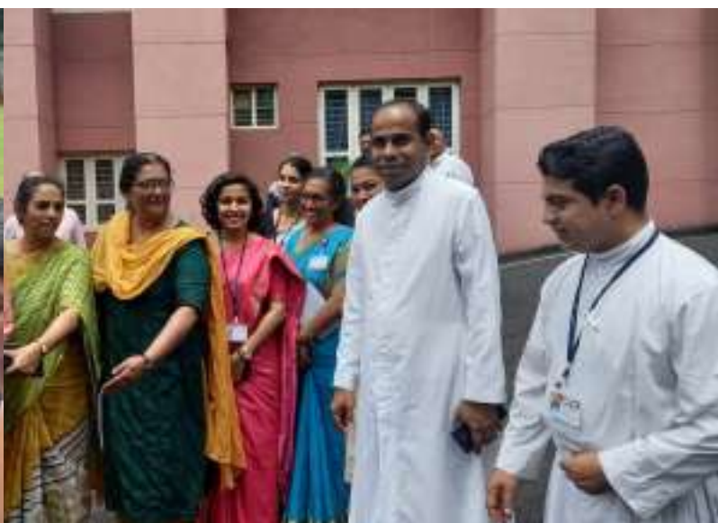
In the meantime, Dr Shashi Tharoor exchanging pleasantries with the young Loyolites and also answering their queries of all sorts