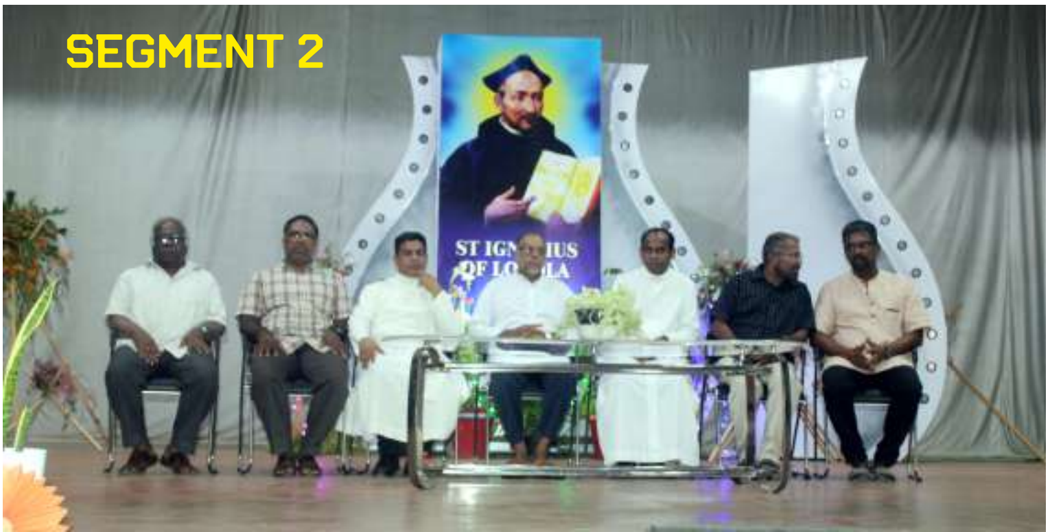
The Jesuits at Loyola Institutions, Sreekaryam, on the dais