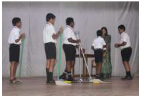
Skit on Values of Jesuit Education, featuring third to eleventh graders