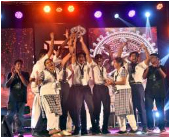
First in Harmony: Sarvodaya Central School