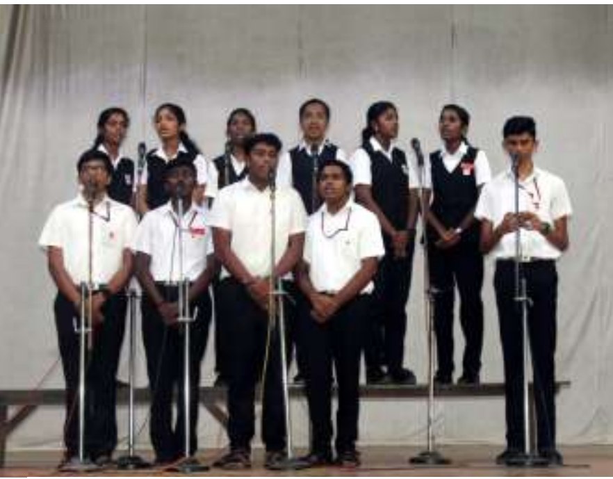
Perfect rendering of two prayers: Take and receive, O Lord & Noble Knight